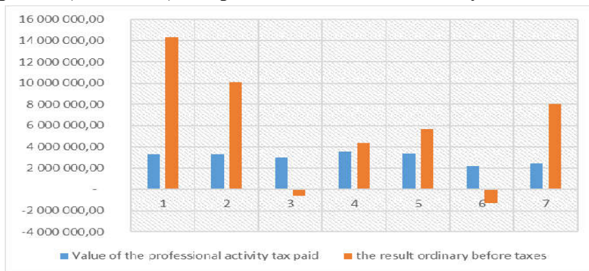
Fig.1. Tax on the professional activity of the economic institution for the period (2015-2021) compared to the result ordinary before taxes